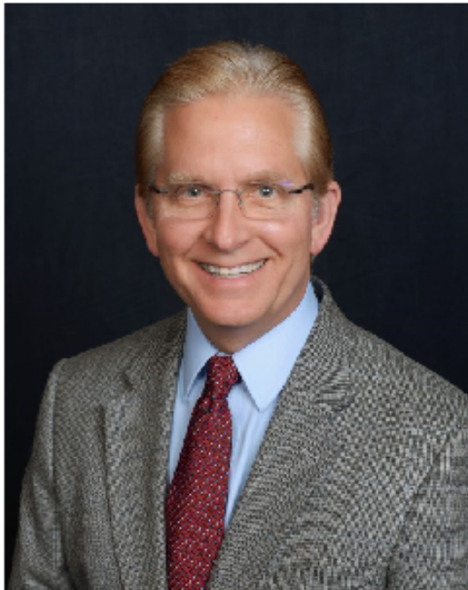
For more information call 703-753-6700