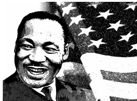
Martin Luther King Jr. Day