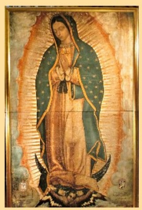
Veneration, Testimony, Healing

First Visitation after the tragic Worldwide Covid 19 Pandemic which has touched so many lives. Our Lady of Guadalupe comes with open hands to bring blessings, hope and peace to those in need.